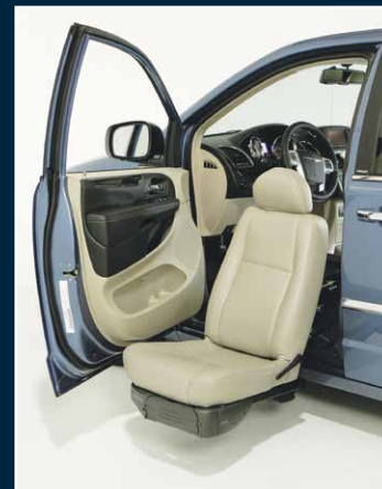
VALET® SIGNATURE SEATING