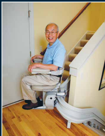
ELITE CURVE Model CRE-2110