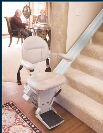
ELITE Model SRE-2010

Home accessibility solutions and automotive products