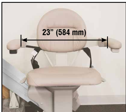
Seat Pad Size: 21.5" (546 mm) wide x 16" (406 mm) deep

Measuring 23" (584 mm) in width between the armrests, the larger seat option also features additional seat depth for added comfort and complete support.