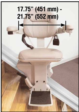
Seat Pad Size: 17.5" (445 mm) wide x 15" (381 mm) deep

Personalized comfort is one of the hallmarks of the Elite. With armrests that can be adjusted for width requirements, the SRE-2010 standard seat is accommodating and secure. The seat height and footrest height are independently adjustable, assuring a personal fit for unparalleled ease and stability.