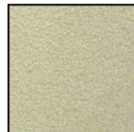
Paint - Option (Painted rail option not available on folding rails)