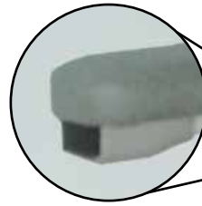
Up/Down Rocker Switch Controls Swivel Seat

Power Swivel Seat will increase the seat height. Please refer to SRE-2010 typical drawings for details.