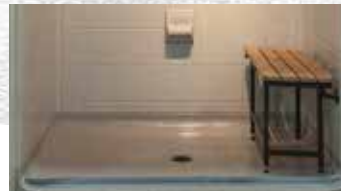
Final Step in Floor Safety

The best line of defense against slip and fall accidents. Designed to be used in demanding indoor and outdoor environments.