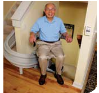
Mid-park and charge station for staircases with middle landings.