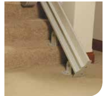
Powder-coated champagne painted rail.