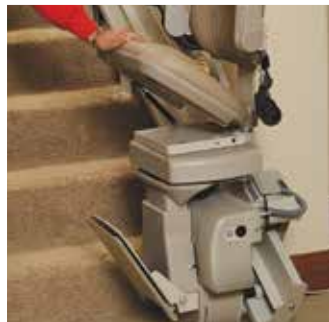
Power folding footrest automatically flips up/down when seat is raised/lowered.