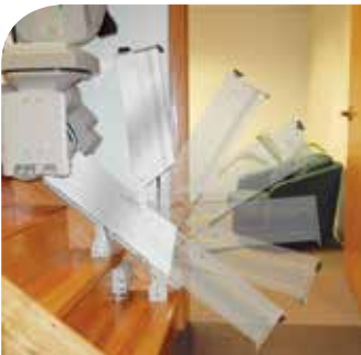
Power or manual folding rails for narrow hallway or when doorway is at the bottom of stairs. Manual operation or push button automatic.