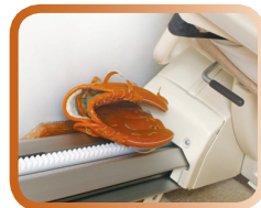
Safety sensors on carriage and platform stop the lift instantly at obstacles.

As with all Pinnacle stair lifts, the HD model is engineered to the highest industry standards and designed for optimal comfort, convenience and aesthetics.