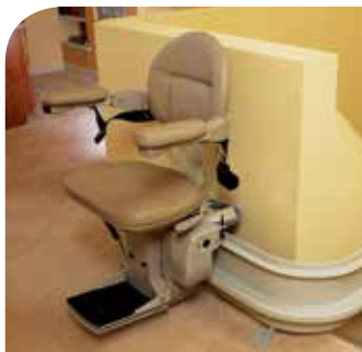
Top or bottom park position extends rail away from the staircase.