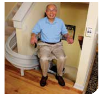
Mid-park and charge station for staircases with middle landings.